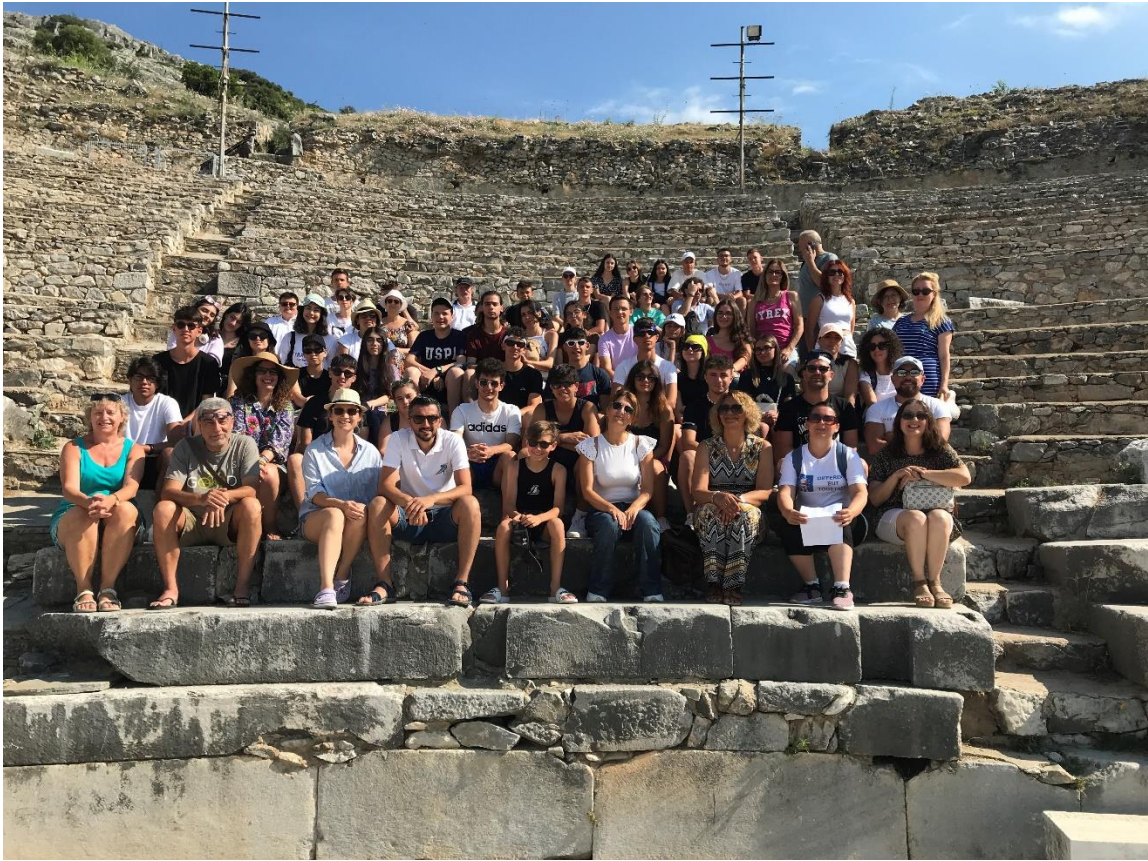
All the participants in "Greek theatre"