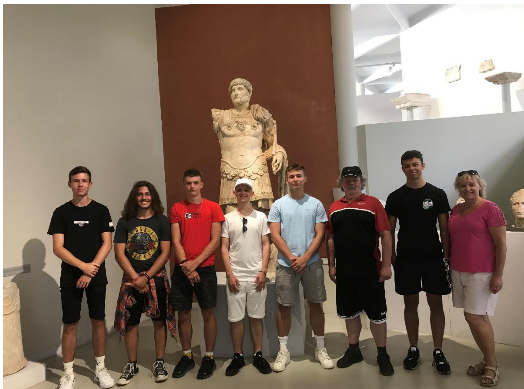
Czech Republic was represented by a delegation of 2 teachers and 6 students.

Participants in this mobility were delegations from all 5 participating countries, i.e., Romania, Turkey, Italy, Greece, and the Czech Republic. The program prepared by the Greek school was full of cultural and sports activities in the city of Kavala, the surrounding area and on the island of Thassos. During the week, the participants got to know the school and its educational system.