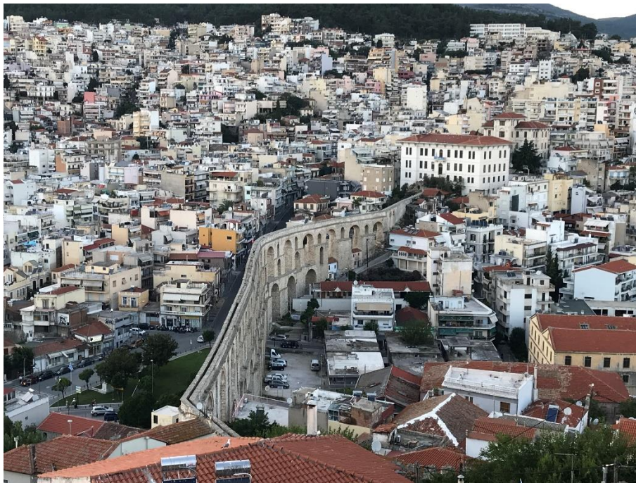
The city Kavala

Part of the program was a tour of the historic centre of Kavala, the aqueduct, and the fortress, as well as an introduction to a local businessman - the owner of a bakery, who after many years as a bank manager started his own business and prepares various types of bread and other bakery products. His business is very popular, i.e., successful.