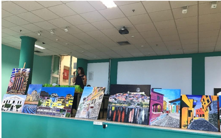
The Greek school prepared for the participants an exhibition of drawings and paintings painted by students and teachers of the school. The subject was the monuments of the city of Kavala.

Part of the program was a tour of the historic centre of Kavala, the aqueduct, and the fortress, as well as an introduction to a local businessman - the owner of a bakery, who after many years as a bank manager started his own business and prepares various types of bread and other bakery products. His business is very popular, i.e., successful.